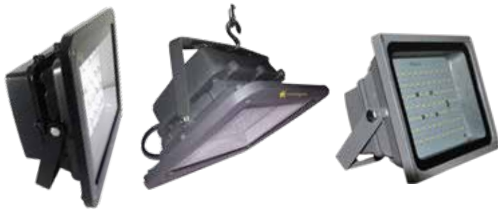
LED FLOOD LAMP (STANDARD / PREMIUM)