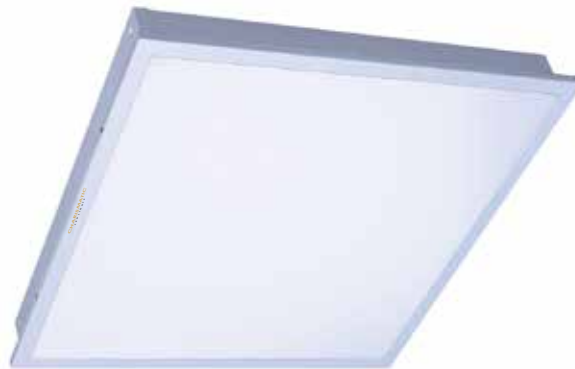
2*2 back-Lit Panel