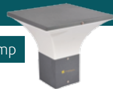
Gate Lamp/Post Lamp