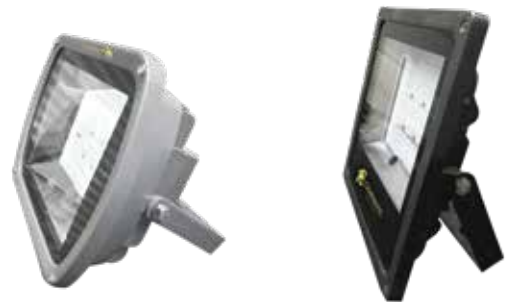
LED FLOOD LAMP (DOWN CHOKE)